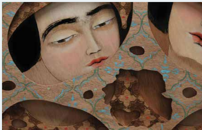
Hayv Kahraman, Decagram 2 , 2013. Corporeal Mapping series. Oil on panels, 46 x 46 inches. ©Hayv Kahraman.

Wonders of Creation is also supported by The Getty Foundation as a grantee of its Pacific Standard Time initiative, which brings diverse organizations together by providing generous funding toward projects and programs responding to a special theme. In